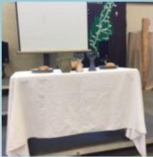
The Lord's Supper