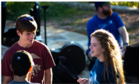
Mo-TLC: Teen Leadership Conference June 7-12