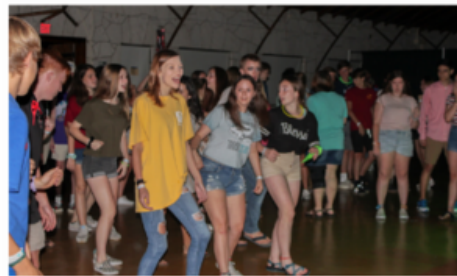
Youth Celebration June 21-26