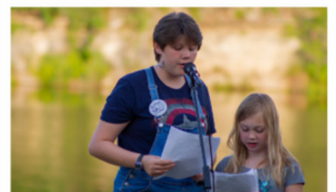
Jr. High Jubilee 2 July 5-9