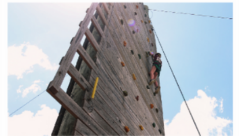
Jr. High Jubilee 1 June 28-July 2