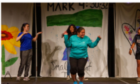
Multicultural Youth Conference July 2-5